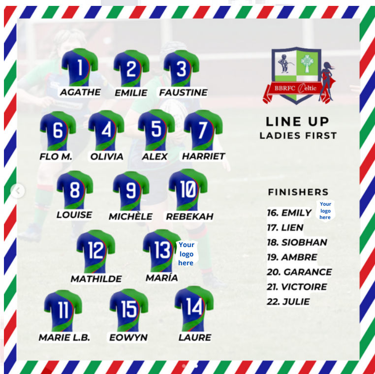
Matchday line up